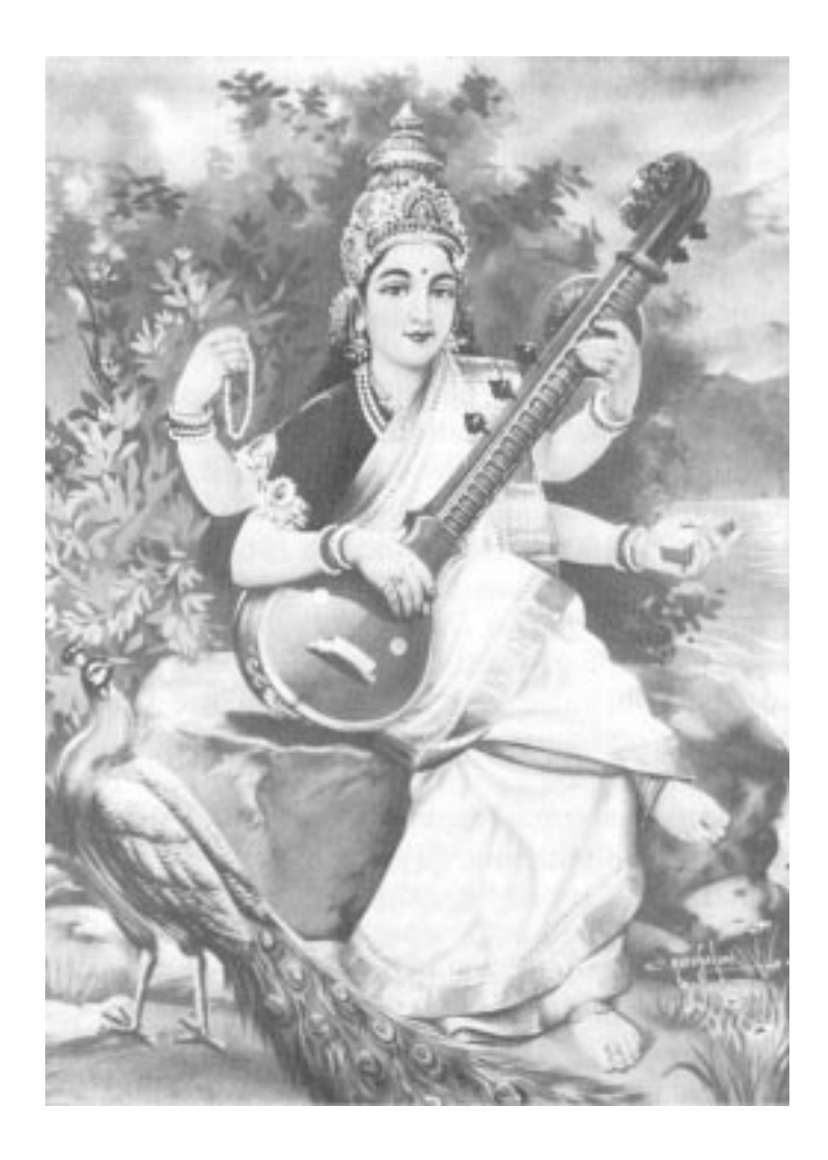
MOTHER SARASWATHI The presiding Deity over Creation and Dissolution

Once you have accomplished your task on the negative side, that of breaking down the impure propensities and old vicious habits, the next step is to build up a sublime spiritual personality, to acquire positive qualities in place of the eliminated demoniacal qualities. The divine qualities that Lord Krishna enumerates in the Gita, have to be acquired. The aspirant must cultivate and develop all the auspicious qualities. He has to earn immense spiritual wealth to enable him to pay the price for the rare gem of divine wisdom. If this development of the opposite qualities is not undertaken in right earnest, the old demoniacal nature will raise its head again and again. Hence, this stage is as important in an aspirant's career as the previous one. The essential difference is: the former is a ruthless, determined annihilation of the filthy egoistic lower self; the latter is an orderly, steady, calm and serene effort to develop purity. This pleasanter side of the aspirant's Sadhana is depicted by the worship of Mother Lakshmi. She bestows on Her devotees the inexhaustible divine wealth or Deivi Sampath. Lakshmi is the wealth-giving aspect of God. She is purity itself. Thus the worship of Goddess Lakshmi is performed during the second set of three days.